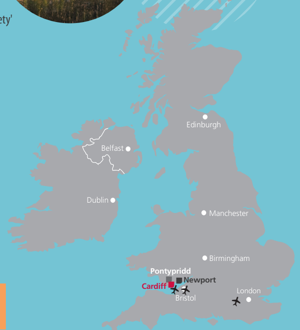
Pontypridd Campus, Treforest