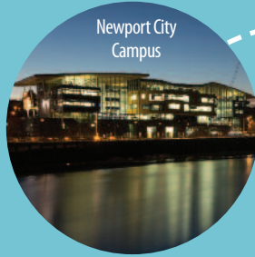
Newport City Campus