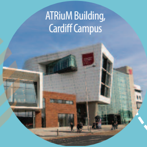
ATRIUM Building, Cardiff Campus